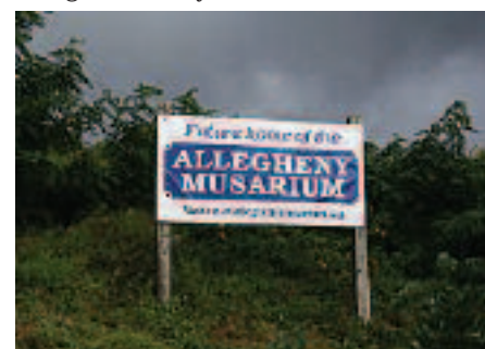
LOCAL ATTRACTION: The 30-acre site along Route 6 for the future Allegheny Musarium.

Their mission for the Allegheny Musarium is to restore, through tourism, the economic prosperity of the region with a venue that promotes education and environmental conservation. Their vision is to be the best and largest museum/aquarium in the world. The Allegheny Musarium Association (AMA) is a 501c3 non-profit organization governed by a board of directors,