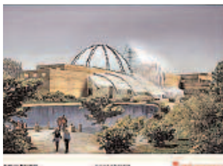
VISION: An artist's rendering of the proposed "Musarium."

THE SCHOOL buses roll past Youngsville, filled with students from the Pittsburgh area on their way to the Allegheny Musarium for their May 2011 class