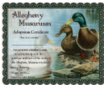
DONOR ART: This certificate represents a sponsor for the Mallard Duck exhibit.

The potential economic impact of this project will be comparable to similar aquariums around the country. Monterey Bay Aquarium in California generates $250 million a year to the state with approximately $170 million of that directly to Monterey County from aquarium and tourism spending. The Tennessee Aquarium in Chattanooga generates $133 million in direct and indi-